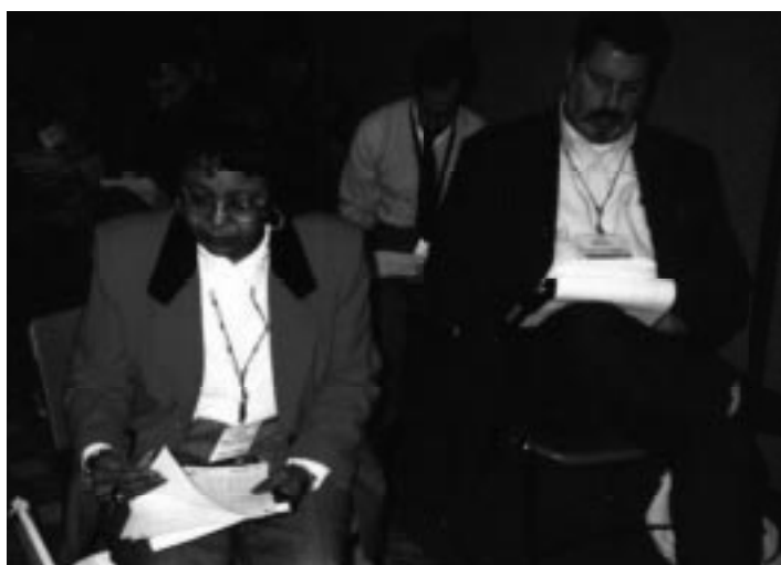
Participants review the draft standards at the hearing conducted at the American Vocational Association Convention in Las Vegas, Nevada.

After the second round of review in the spring, the third draft of the Standards will be field tested in the fall of 1998. The draft will then go through a final period of revision and refinement during the winter of 1998-1999 before being published. The Standards will be released at the ITEA Conference in Indianapolis, Indiana on March 28-30, 1999.