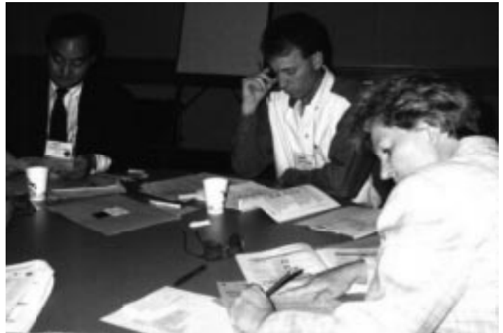
The draft standards are reviewed by participants at the Work Now and in the Future Conference in Portland, Oregon.