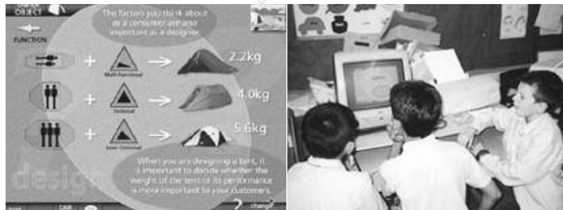
Figure 2. Technical manufacturing Considerations Impacting on Design.