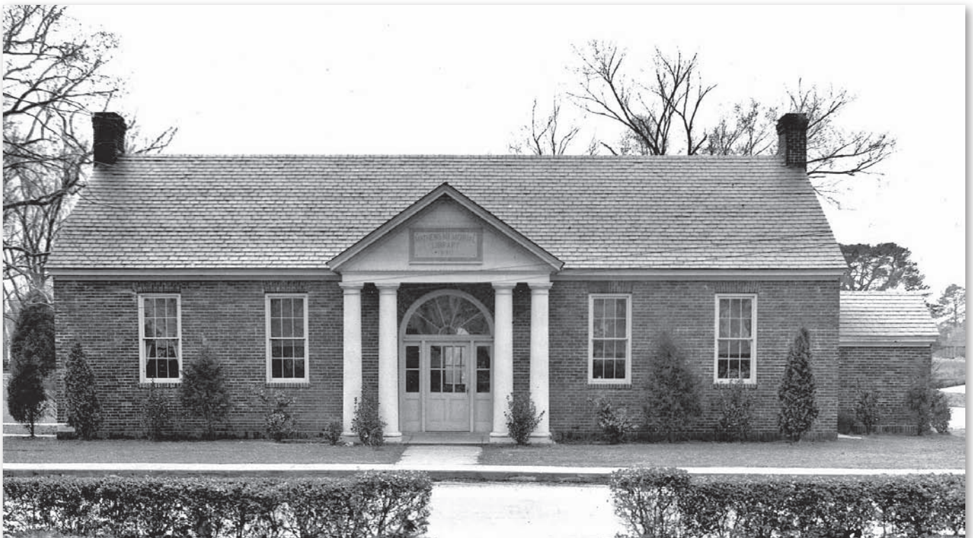
Original library built in the 1930s and dedicated in 1935.