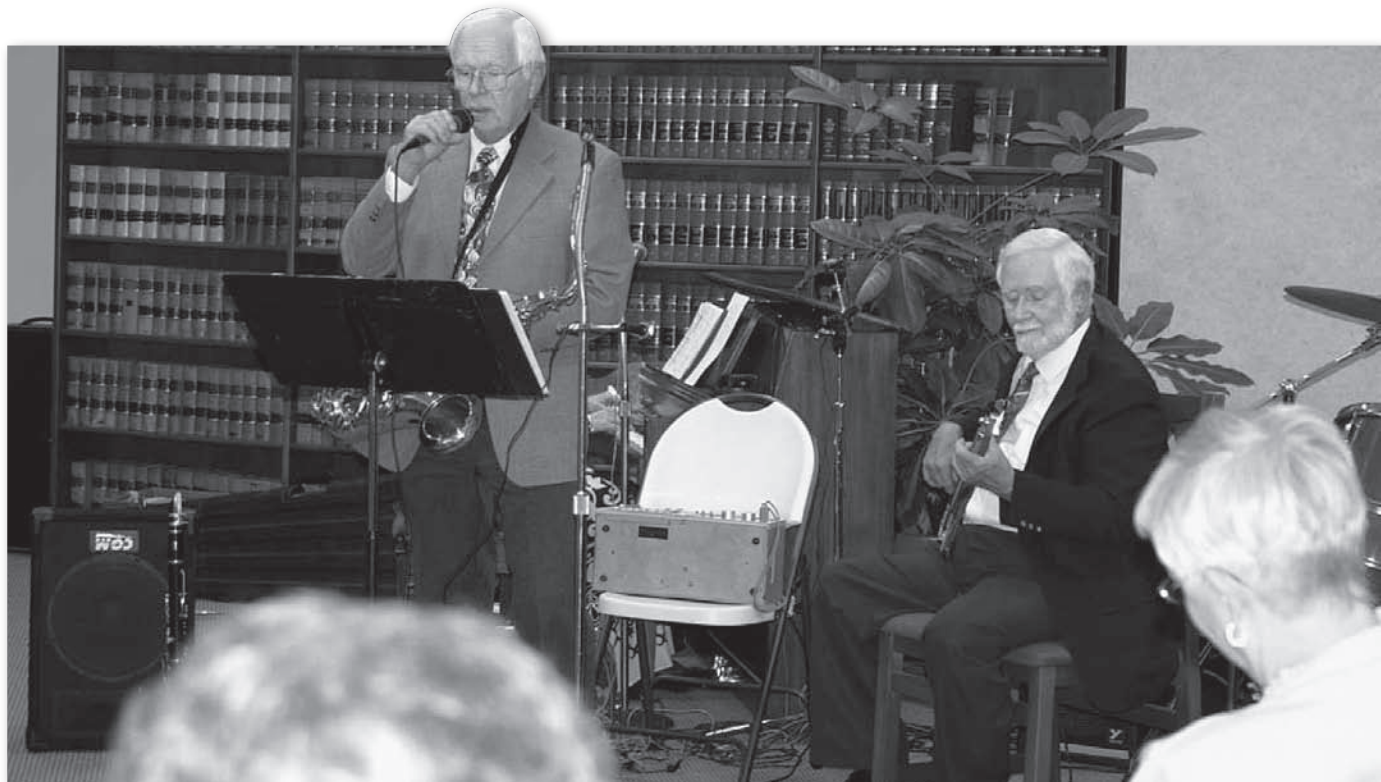
An adult program in the John Warren Cooke Conference Center.