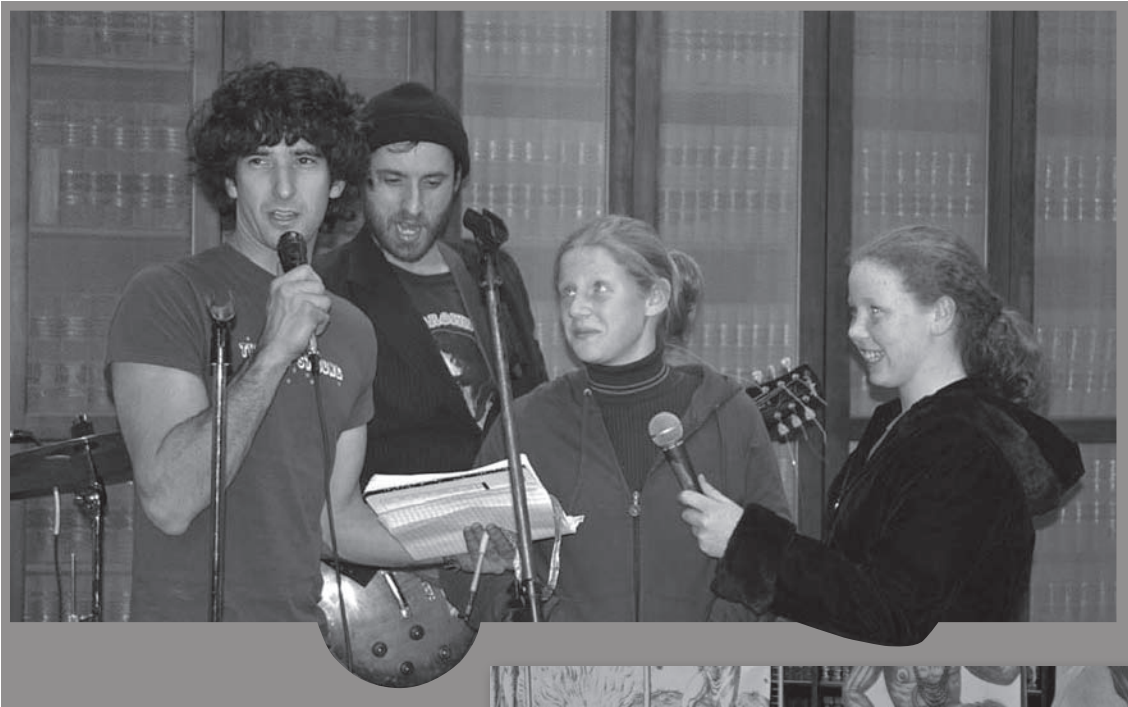
Left, rock-and-roll teen program in the John Warren Cooke Conference Room.