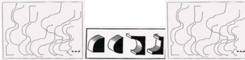
Center: several types of mouldings; right and left: variations on Roman Ionic mouldings from Etruscan and Republican Roman Mouldings , 1965.

her work as a scholar and teacher. She says she "can't think of anything happier to spend her life on" than her work.