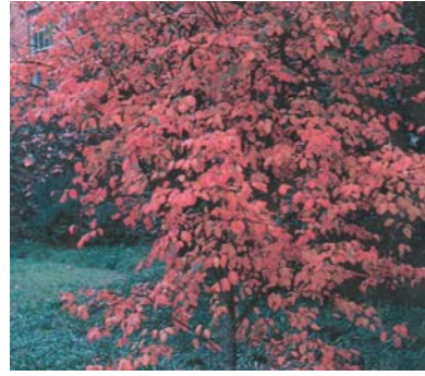
Amelanchier arborea (Serviceberry) ◆ South east corner