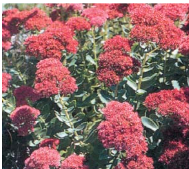
Sedum spectabile 'Autumn Joy' (Stonecrop)