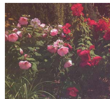
Hibiscus mosechuetos (Rose Mallow)