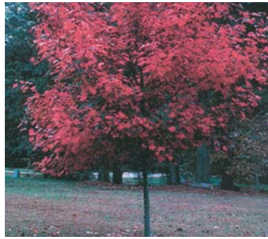
Acer rubrum (Red Maple) ◆ Street tree