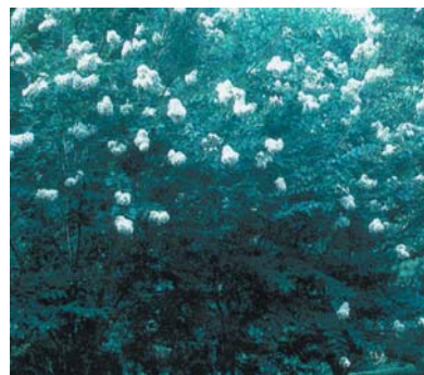
Lagerstroemia indica 'Natchez' ◆ Service courts