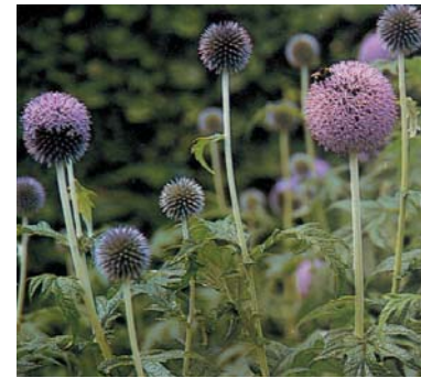
Echinops humilis (Globe-thistle)