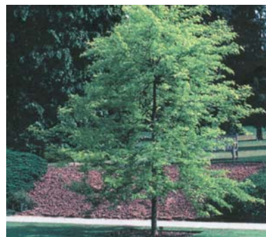
Gleditsia triacanthos var. inermis (Thornless Common Honeylocust) ◆ South garden