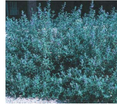
Caryopteris x clandonensis (Bluebeard) ◆ North garden