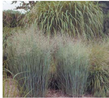
Panicum virgatum 'Heavy Metal' and 'Hanse Herms' (Blue and Red Switch grass)