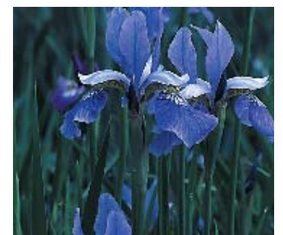
Iris sibirica (Siberian Iris)