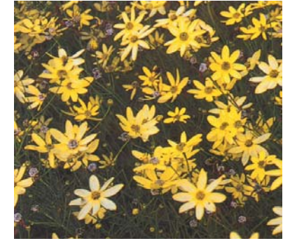
Coreopsis verticillata 'Moonbeam' (Threadleaf coreopsis)