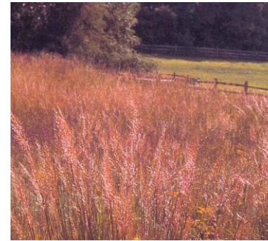
Sorghastrum nutans (Indian grass)