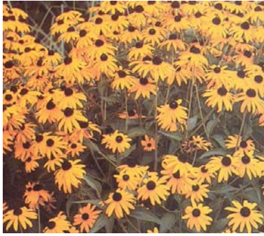
Rudbeckia fulgida 'Goldsturm' (Orange Coneflower)