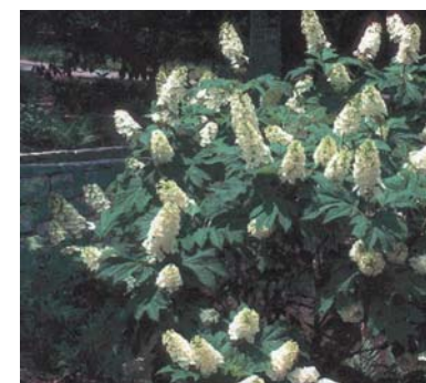
Hydrangea quercifolia (Oakleaf Hydrangea) ◆ North garden