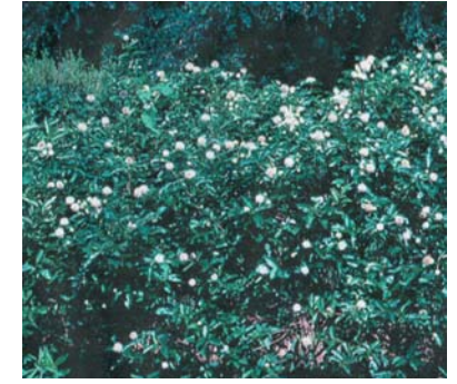
Cephalanthus occidentalis (Buttonbush) ◆ Swale ◆ North garden