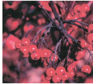
Aronia arbutifolia (Red Chokeberry) ◆ Swale ◆ North garden