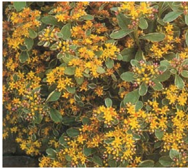
Sedum kamtschaticum (Stonecrop)