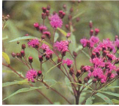
Vernonia noveboracensis (New York Ironweed)