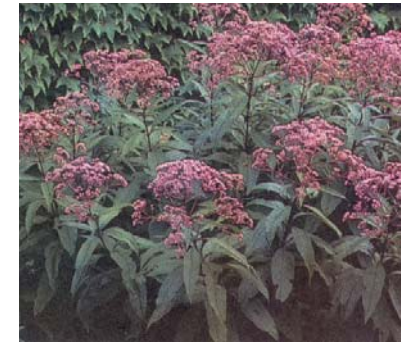
Eupatorium purpureum (Joe-Pye Weed)