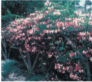
Lonicera periclymenum 'Serotina' (Woodbine Honeysuckle)