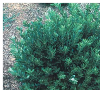
Ilex glabra (Inkberry) ◆ Swale ◆ North garden