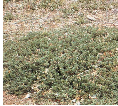
Arctostaphylos uva-ursi (Bearberry)