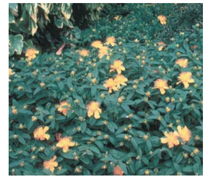
Hypericum calycinum (Aaron'sbeard St. Johnswort) ◆ Ground cover on streetside slopes