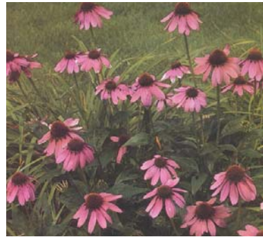
Echinacea purpurea (Purple Coneflower)