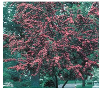
Crataegus (Hawthorn) ◆ Hawthorn allee walk