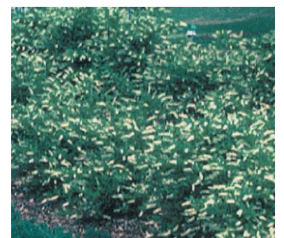
Itea virginica (Virginia Sweetspire) ◆ Swale ◆ North garden