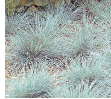
Festuca glauca 'Elijah Blue' (Blue Fescue)