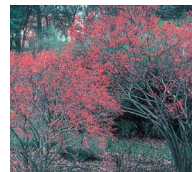
Ilex verticillata (Winterberry) ◆ Swale ◆ North garden