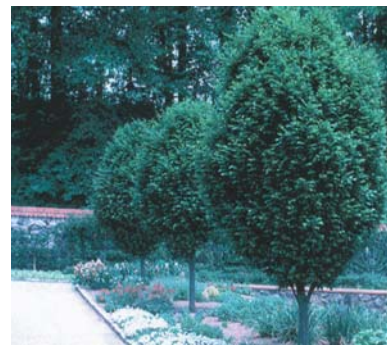
Carpinus betulus (European Hornbeam) ◆ North garden