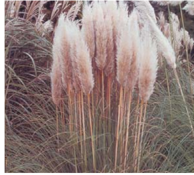
Cortaderia selbana 'Pumila' (Compact Pampa grass)