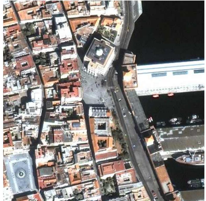
Fig. 2 Zoom into site