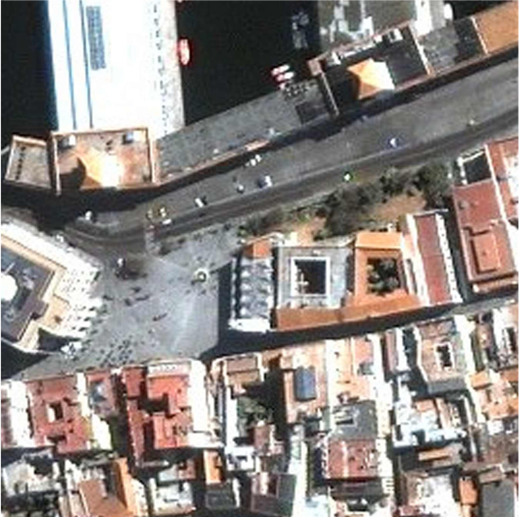
Fig. 3 Convent of San Francisco