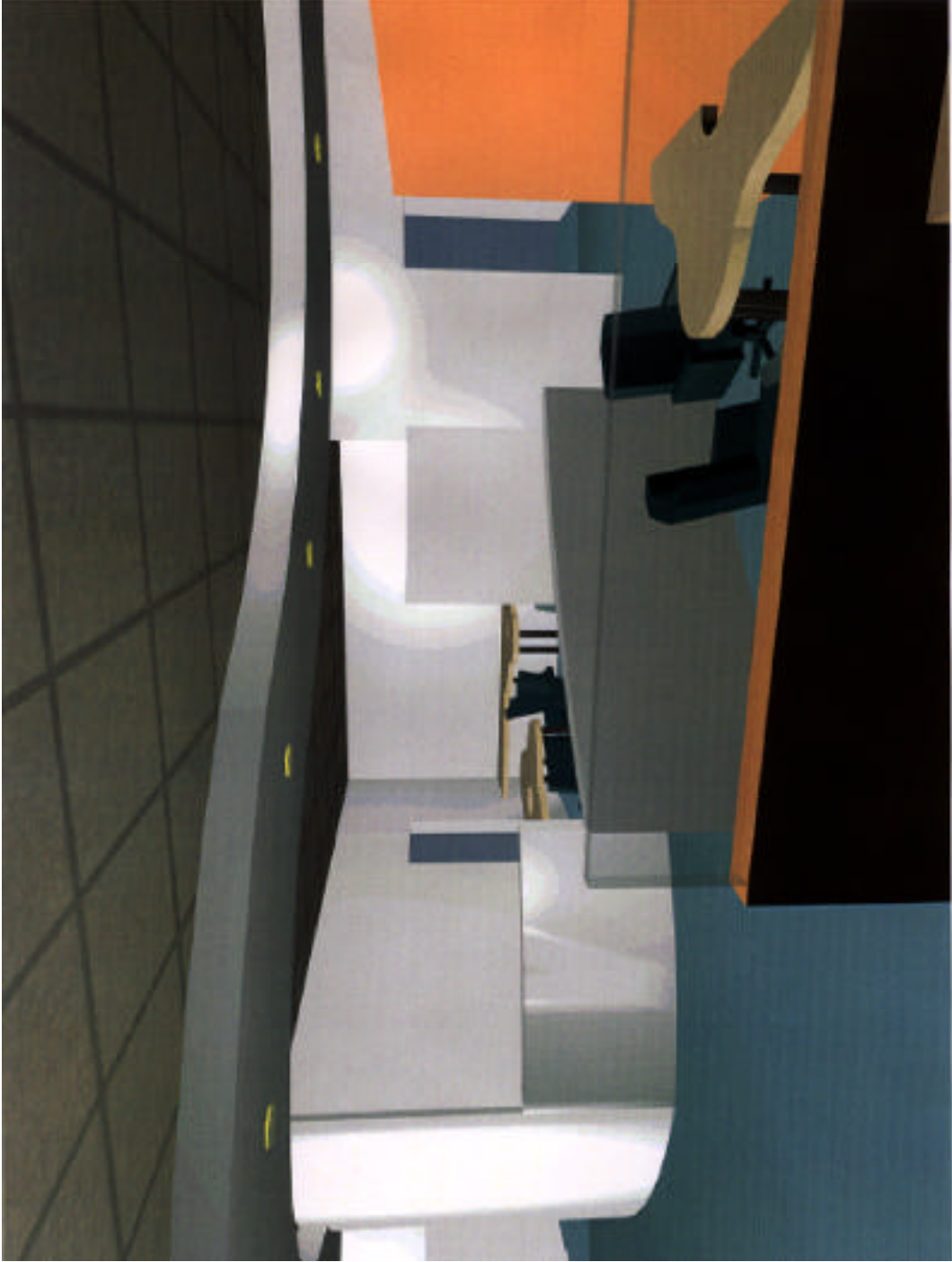
Figure 18. Computer Model of the Revised Space Prototype, View C