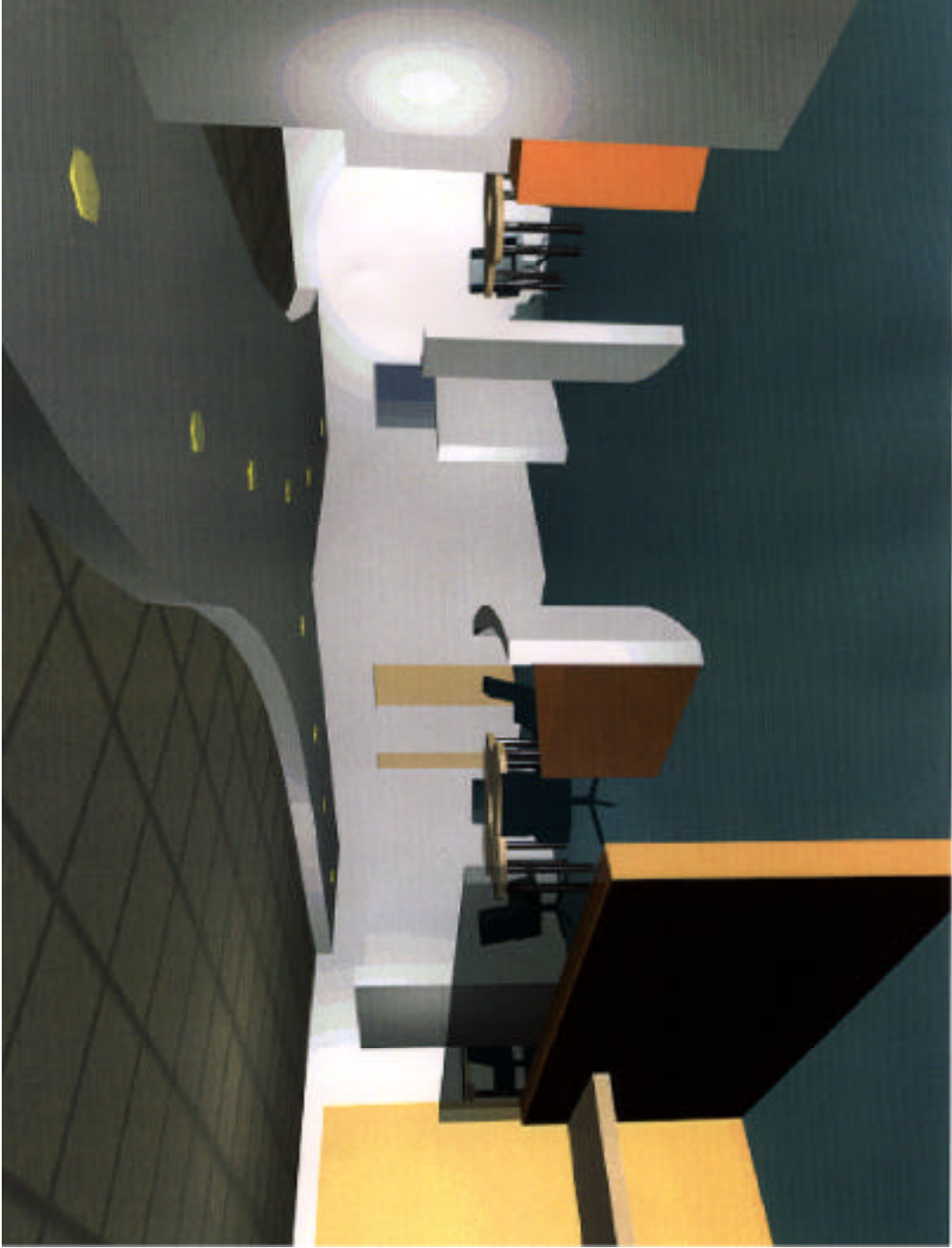
Figure 17. Computer Model of the Revised Space Prototype, View B