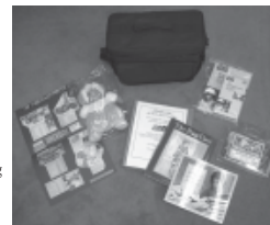
Shared Lives Anti-Bias Tool Kit