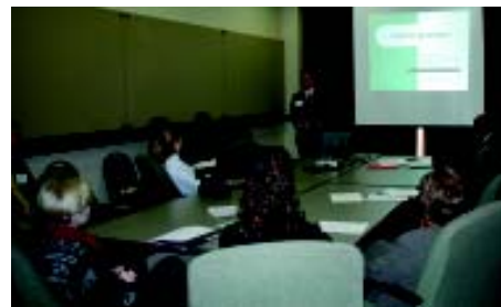
2005 Undergraduate Diversity Research presentations

To register or to submit a proposal for the conference, visit http://www.conted.vt.edu/macsd .