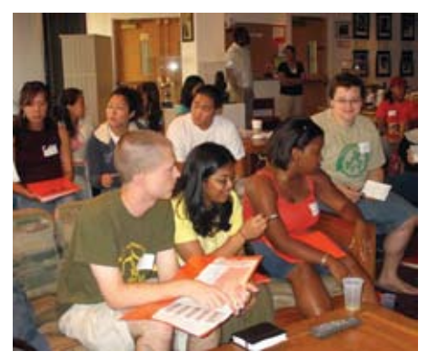
MPS fall leadership training

heritage month celebrations and several student support services. In the spring of 2006, renovations began in Squires Student Center to give MPS a home and to raise the level of awareness of the value that the University places on diversity-related education.