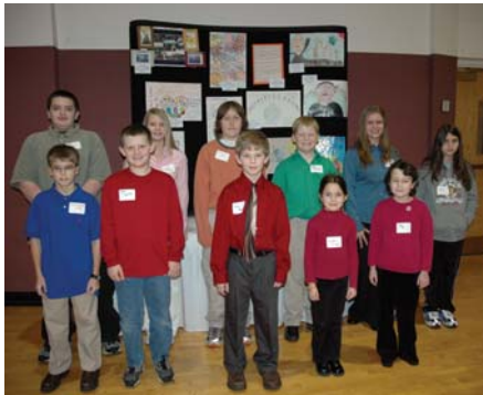
Eleven of the sixteen winners from the 2006 MLK poster and essay competition

At the men's home basketball game against Virginia on Sunday night and the women's home basketball game against Virginia on Monday night, volunteers from the committee, students from the Presidential Campus Enrichment Grant, and athletic staff from promotions placed a folded flyer on every seat in Cassell Coliseum. The flyer