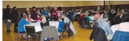
over 300 people attended the community breakfast

He voiced the doubts and concerns he felt throughout