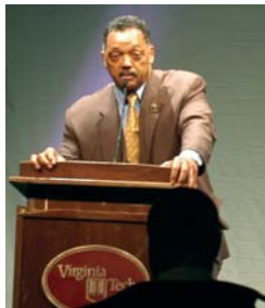
Rev Jesse Jackson takes questions after his speech.

More than 3,000 diverse, energetic people stood, applauded, and welcomed Reverend Jesse Jackson into Burruss Hall Auditorium. He began, sharing statistics to confirm his belief that Martin Luther King Jr. Day should not commemorate the "I Have a Dream" speech, but continually revisit Dr. King's underlying message of "The Broken Promise."