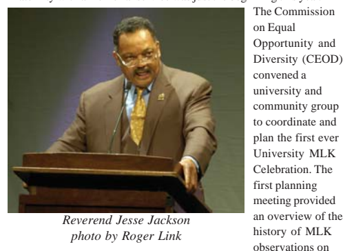
Reverend Jesse Jackson

The traditional honoring of Dr. King by the Alpha Phi Alpha Fraternity with a memorial service was just the beginning this year.