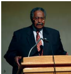
Franklin McCain

Franklin McCain, the guest speaker for the Martin Luther King Jr. Community Breakfast at Virginia Tech, is one of the original four who took part in the Woolworth sit-ins. He was born in Union County, NC, and reared in Washington, D.C. He received his B.S. degree in chemistry and biology from North Carolina A&T State University in 1964. He is married and has three sons. In 1965, he joined the Celanese Corporation