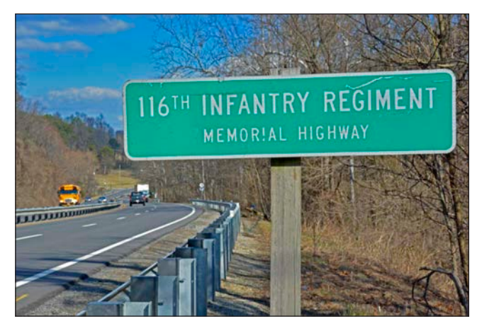
Route 460, a section of which memorializes the 116th Regiment; photo taken on segment between Elliston and Salem, Virginia

Virginia. The Virginia National Guard regiments also supplied companies of men who were reformed into the 112th Machine Gun Battalion, which served with the 116th Regiment in its campaigns in France.