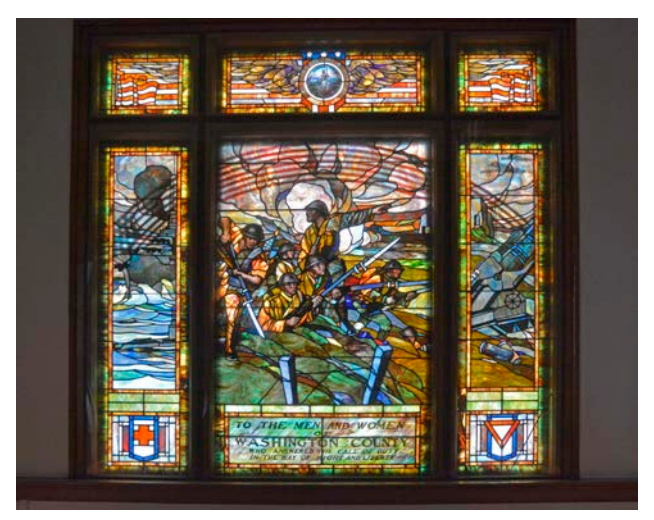
Tiffany stained glass window honoring those who served in World War I, Washington County Courthouse, Abingdon, Virginia