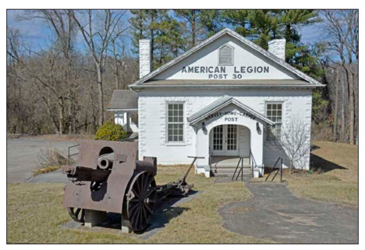
Harvey-Howe-Carper American Legion Post, Radford, Virginia

served and more than four thousand of these died from disease, combat, and training accidents.<sup>8</sup> It is difficult to ascertain what percentage of Virginia's total contribution in manpower and casualties can be counted as coming from Southwest Virginia, but a conservative estimate would place the number at around 10 percent (see Appendix for list of Southwest Virginia casualties).<sup>9</sup>