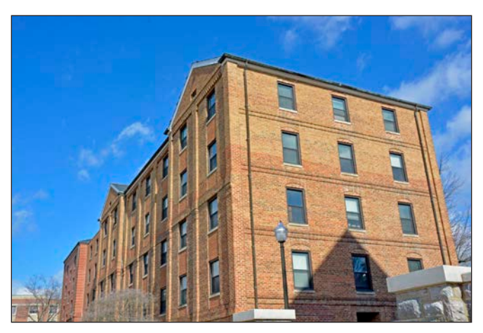
Major Williams Hall, Virginia Tech, Blacksburg

campus bears his name, and it appears on the campus Pylons memorializing cadets who died in war.<sup>37</sup>