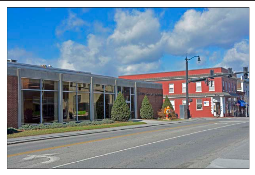
Today's National Bank of Blacksburg can be seen at the left, with the first building specifically constructed to house the bank and its second location visible across Roanoke Street. The bank's third location, across the street from the second site, is reflected in the windows of the current building. All three locations pictured here faced Main Street.

positive report.<sup>48</sup> After many meetings and discussions, the majority seemed ready to move forward.