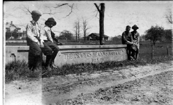
wrs033, Draper's Meadow Requested for Blacksburg Museum Fundraising Brochure and Video

LHPORT0168, Fullen's Mill Requested for Holston, Clinch & Powell River Atlas by the Virginia Canals & Navigation Society