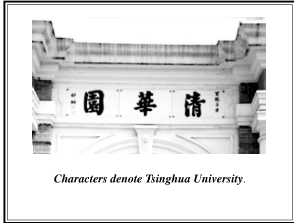
Characters denote Tsinghua University.